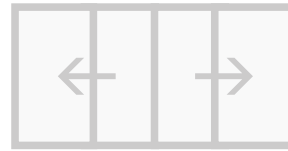
Centre Vent Sliding